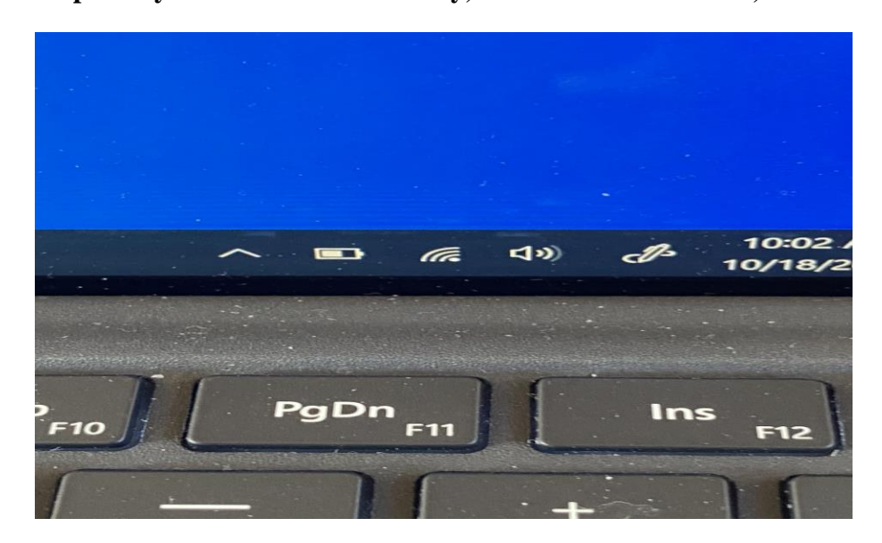
Step 5: If you CONNECT correctly, the ICON will show as, see below:

For trouble shooting or questions please call: (928) 652-3251 EXT 129.