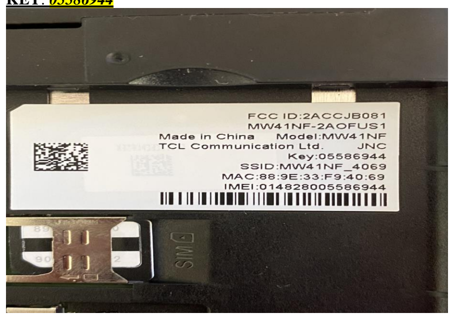
Step 2: Turn on the "Alcatel Device"